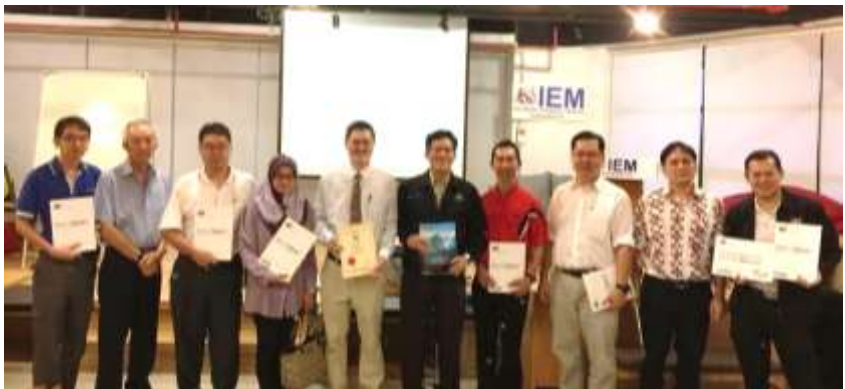
Presentation of Certificate of appreciation and group photo